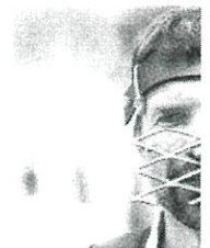
Not wearing a ma option (Part 3)

gyulee@koreatimes.co.kr More articles by this reporter