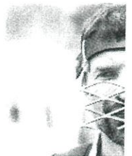
Not wearing a ma option (Part 3)