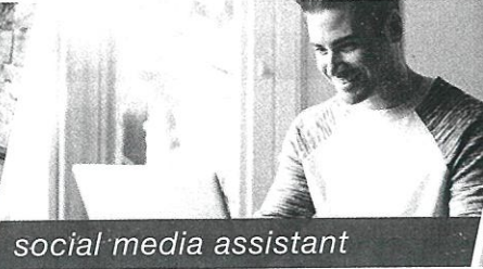
social media assistant