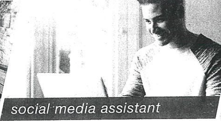
social media assistant