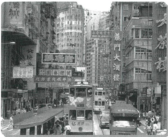
▲ Hong Kong's neighborhoods are lively.

9 Using Sense Details Work in groups of three. Choose one of the photos below. Make lists of sense details that describe the neighborhood. Then use those words to describe the photo.