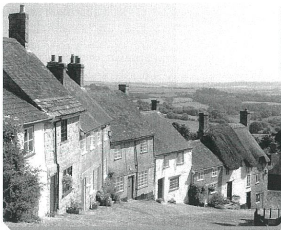
▲ Some villages in Europe don't change much over time.