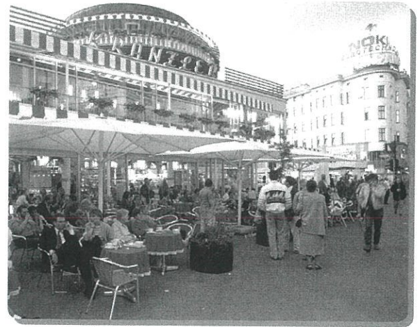
▲ A street in Berlin