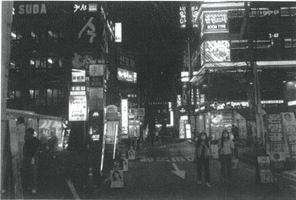
GANGNAM IS WHERE MANY SINGLE PEOPLE LOOK FOR LOVE ON A FRIDAY NIGHT.