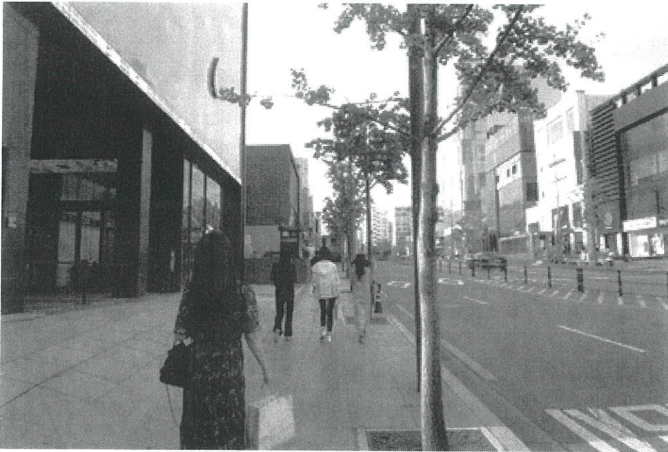
THE STREETS OF APGUJEONG IN GANGNAM.