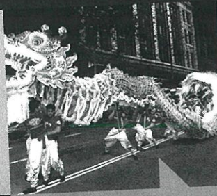
Chinese New Year January or February

Chinese people celebrate the lunar new year with fireworks and dragon dances.