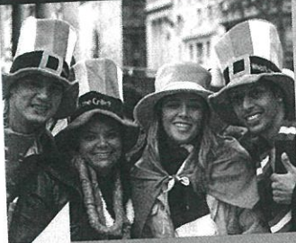
Saint Patrick's Day March 17th

People of Irish background wear green to celebrate their culture with parades, dancing, parties, and special foods.