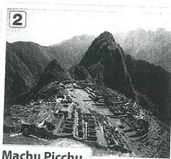
2 Machu Picchu

How big is the city? When was it discovered?