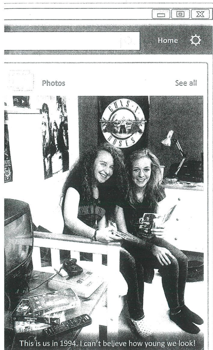
This is us in 1994. I can't believe how young we look!